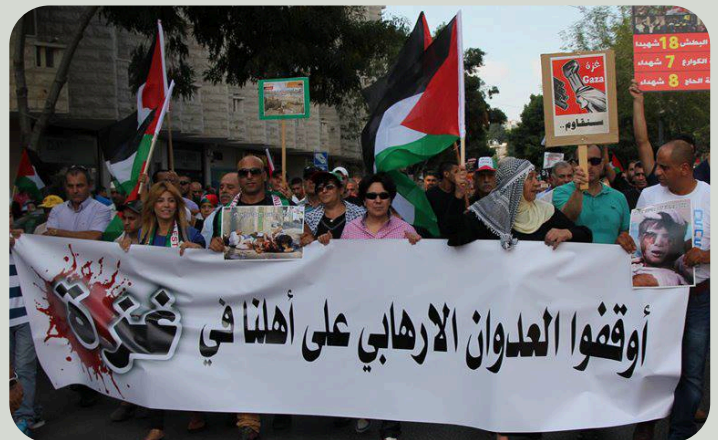
Photos from protest in solidarity with Gaza in Nazareth 21.7.2014

Social media is integral to the protest movement and to youth culture. Due to its accessibility and reach, social media is the primary avenue of news distribution and organization. Protests can now be planned and shared with thousands of people within a matter of minutes. Protests, planned largely through social media, have resulted in large numbers of protesters, particularly youth. While families frequently attend, these protests are organized and primarily attended by young people between the ages of 15–30. While accessibility and reach are the reasons for social media's success, these elements when linked with dissent and monitoring by rightists and police has resulted in harassment, arrest, interrogation, and loss of livelihood.