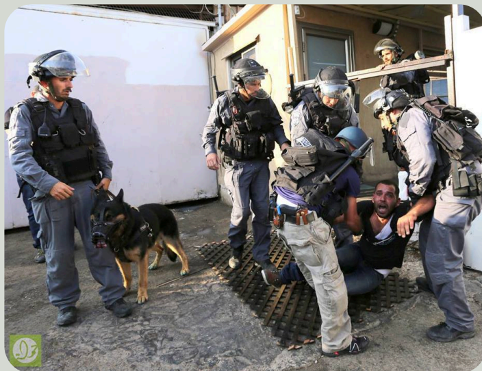
Man assaulted and arrested in Nazareth

With this large and growing movement in solidarity with Gaza, the Israeli authorities are stepping up their efforts to smother dissent within the country. Police are reacting to the large crowds of protesters with increasing brutality; beating and arresting protesters and firing tear gas canisters, stun grenades and putrid smelling water on the large crowds. According to police records, 931 Palestinians have been arrested over the last three weeks in relation to protests: 295 in Jerusalem, and 636 inside Israel (i.e. Palestinians with Israeli citizenship) 1 . Of the 295 arrested in Jerusalem, 71 have been charged 2 . Almost 1000 Palestinians have been arrested including dozens of minors. As protests spread, these figures continue to rise. Israeli police are adopting the same methods used by the military in the occupied territories to deal with dissent, including preemptive arrests and abusive interrogations. This illustrates the position of the government on its Palestinian citizens: whether they are citizens or not, Palestinians are all equally viable targets for collective punishment.